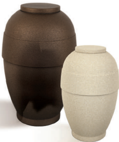
Sand Finishes available in both sizes